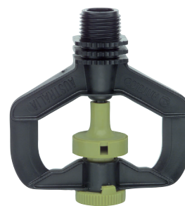
Inverted Rotor Max™