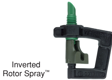
Inverted Rotor Spray™