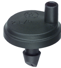
Agri Drip™ Standard Emitter

Suitable for most horticultural tree and row crops, viticulture, and landscaped gardens.