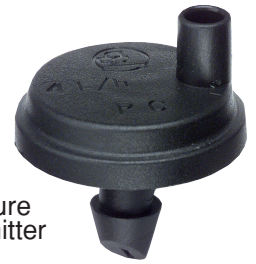
Agri Drip™ Pressure Compensating Emitter