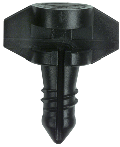
Titan® Jet 180°

A simple fan type spray. Design assists controlled and effective watering in all climatic conditions.