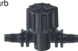
Vari-Flow™ thread x thread