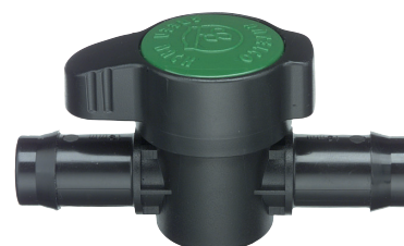
Green Back® Valve

For low pressure (up to 70 psi) micro irrigation systems.